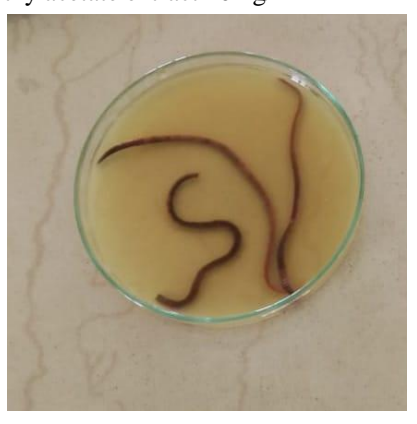
Ethylacetate extract 40mg/ml