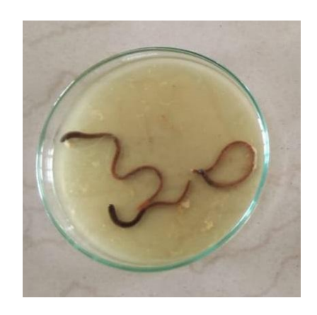
Hydroalcoholic Extract (20:80) 20mg/ml