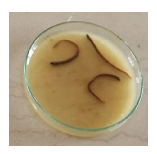
Ethylacetate extract 10mg/ml