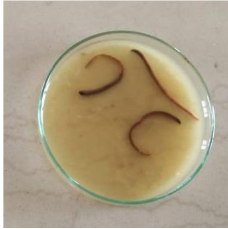
Hydroalcoholic Extract (20:80) 10mg/ml