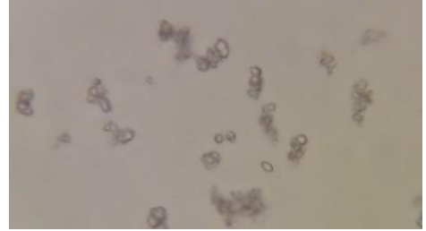
Figure2 Majority of forms crystal calcium oxalate

Calcium oxalate in urine can take form of calcium oxalate monohydrate (COM), calcium oxalate dihydrate (COD) or calcium oxalate trihydrate (COT). COT is a crystal in an unstable form, in certain conditions it will turn to COM. Calcium oxalate used in this study is mostly crystalline in COM form. Process nucleation was occurred by spontaneously for COM in hipercalciuria situation. In the treatment group P3, P4, P5, P6, and P7 the calcium level in the 3rd hour was lower than in the 0 hour, there was not dissolution activity. It was suspected that the nucleation process is still occuring to obtain a stable formation. Nucleation occurs due to a decrease in zeta potential in urine artificial solution (AU) (Beghalia et al. 2007). Some studies suggest that extracts generally work in inhibiting crystallization by encouraging changes in COM to COD (Fouda et al. 2006 and Saha et al. 2013).The form of calcium oxalate crystals is presented in Figure 2.